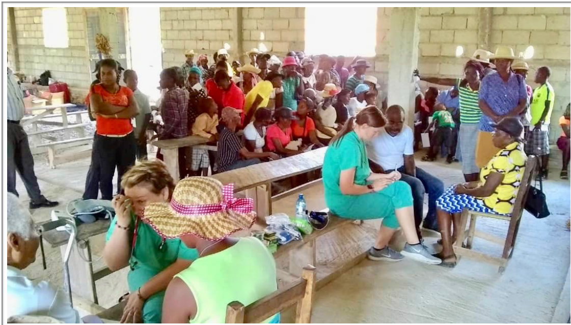
Patients await the services of the medical mission team at St. Mother Teresa Chapel

Grateful patients, at four locations of our twin parish, received the services of our fifth medical mission from April 4th through 8th. Although the trip had been delayed because of unrest throughout Haiti, both the travel and the transportation of nine suitcases of medications and supplies, went flawlessly.