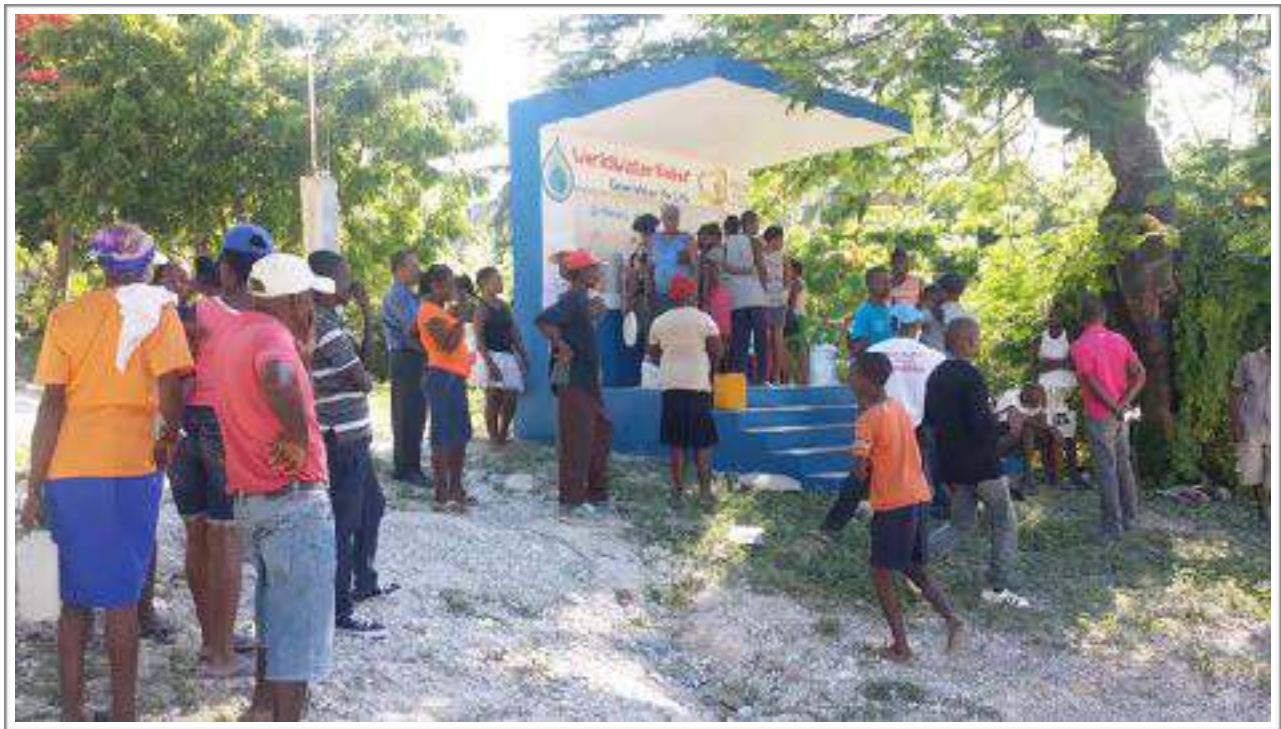
The community of Mayette gathers for the first distribution of water.