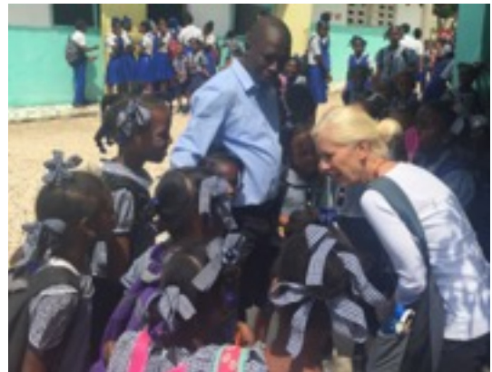
Day 3: We visit St. Joseph parish school during lunch; teachers answer questions.